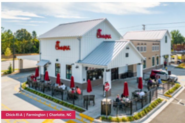
Chick-fil-A | Farmington | Charlotte, NC