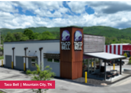
Taco Bell | Mountain City, TN