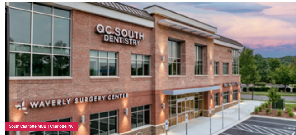
South Charlotte MOB | Charlotte, NC