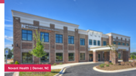
Novant Health | Denver, NC