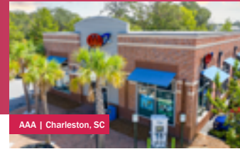
AAA | Charleston, SC