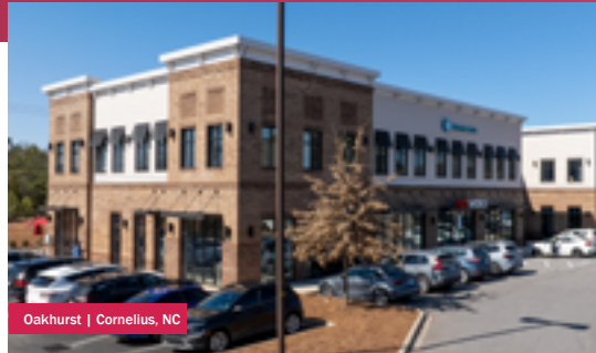
Oakhurst | Cornelius, NC