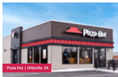
Pizza Hut | Hillsville, VA