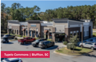
Tupelo Commons | Bluffton, SC