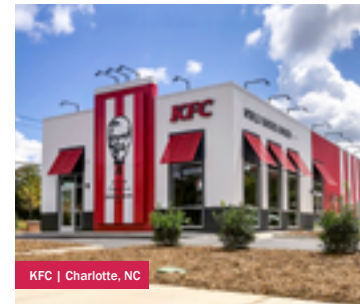
KFC | Charlotte, NC