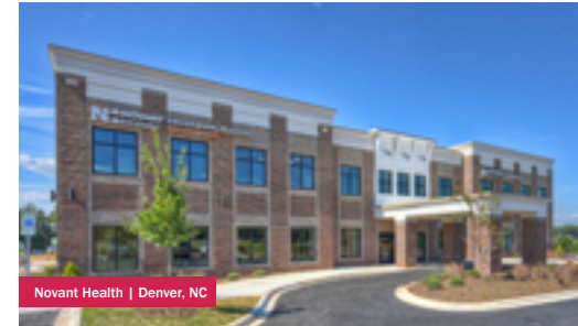
Novant Health | Denver, NC