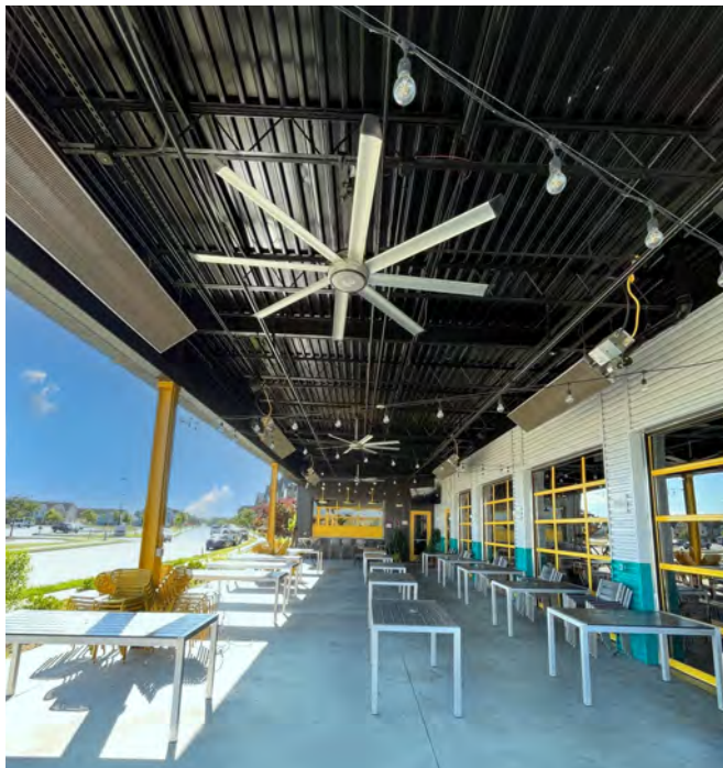
Outdoor Covered Patio