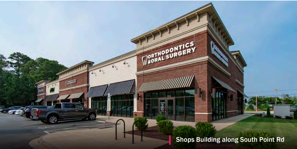
Shops Building along South Point Rd