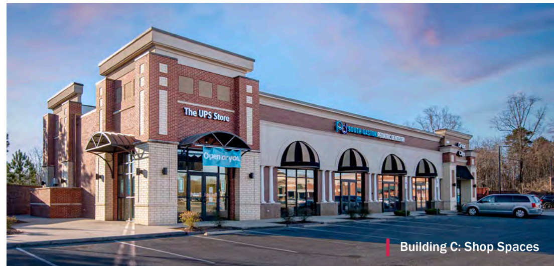
Building C: Shop Spaces