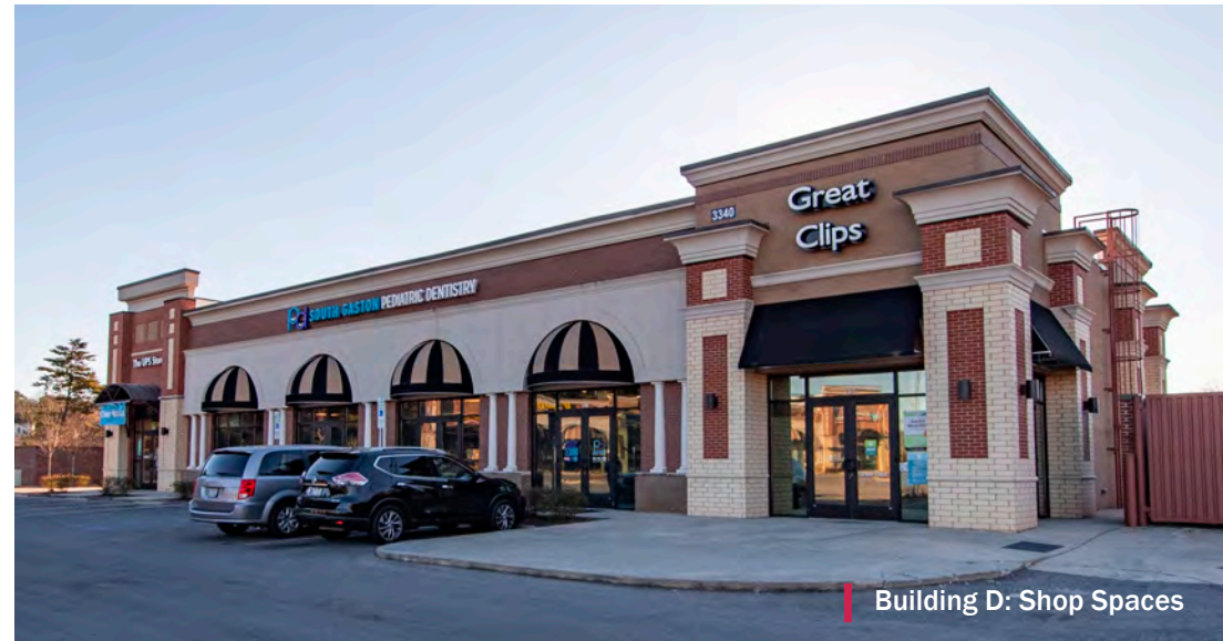
Building D: Shop Spaces