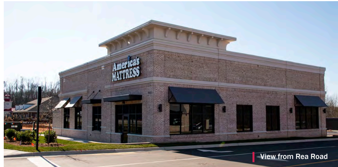
View from Rea Road