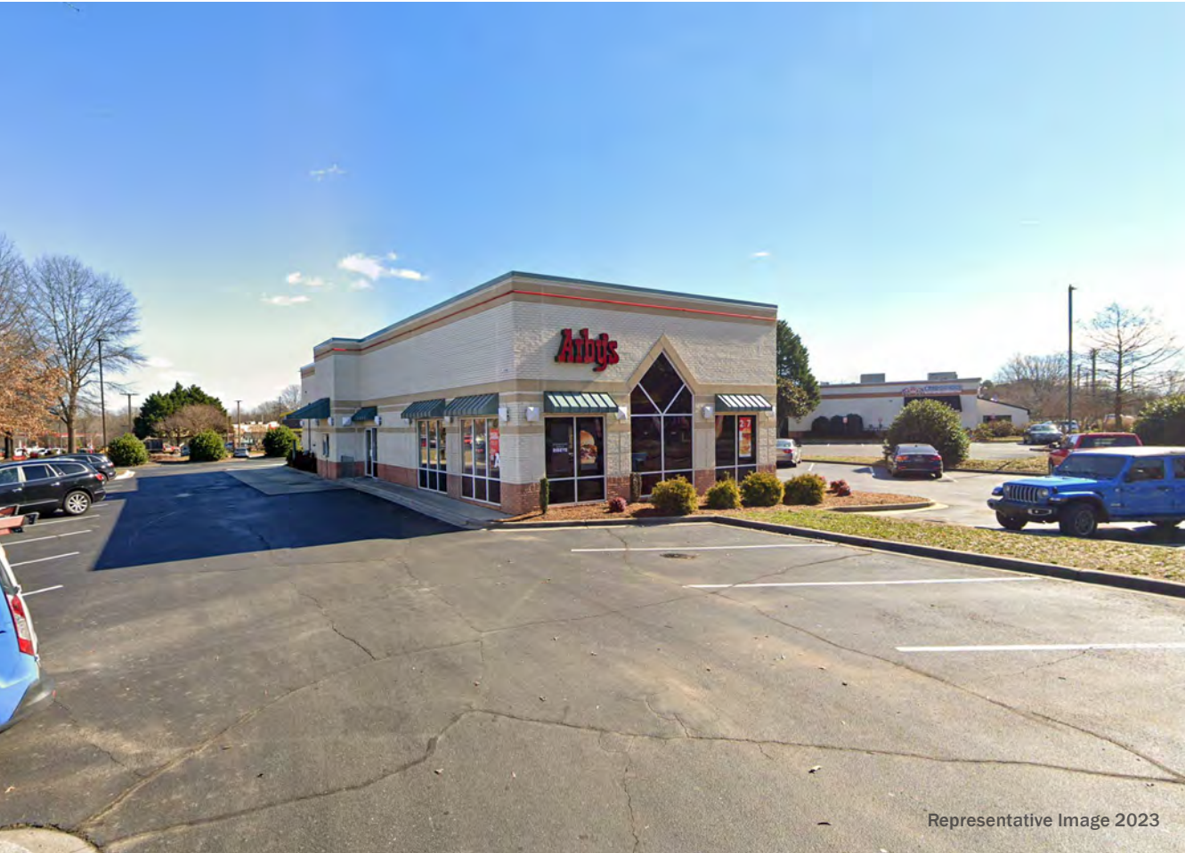
Representative Image 2023