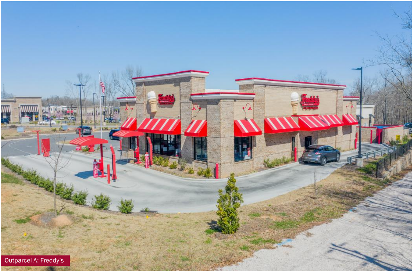
Outparcel A: Freddy's

RedStone 9650 Red Stone Dr, Indian Land, SC