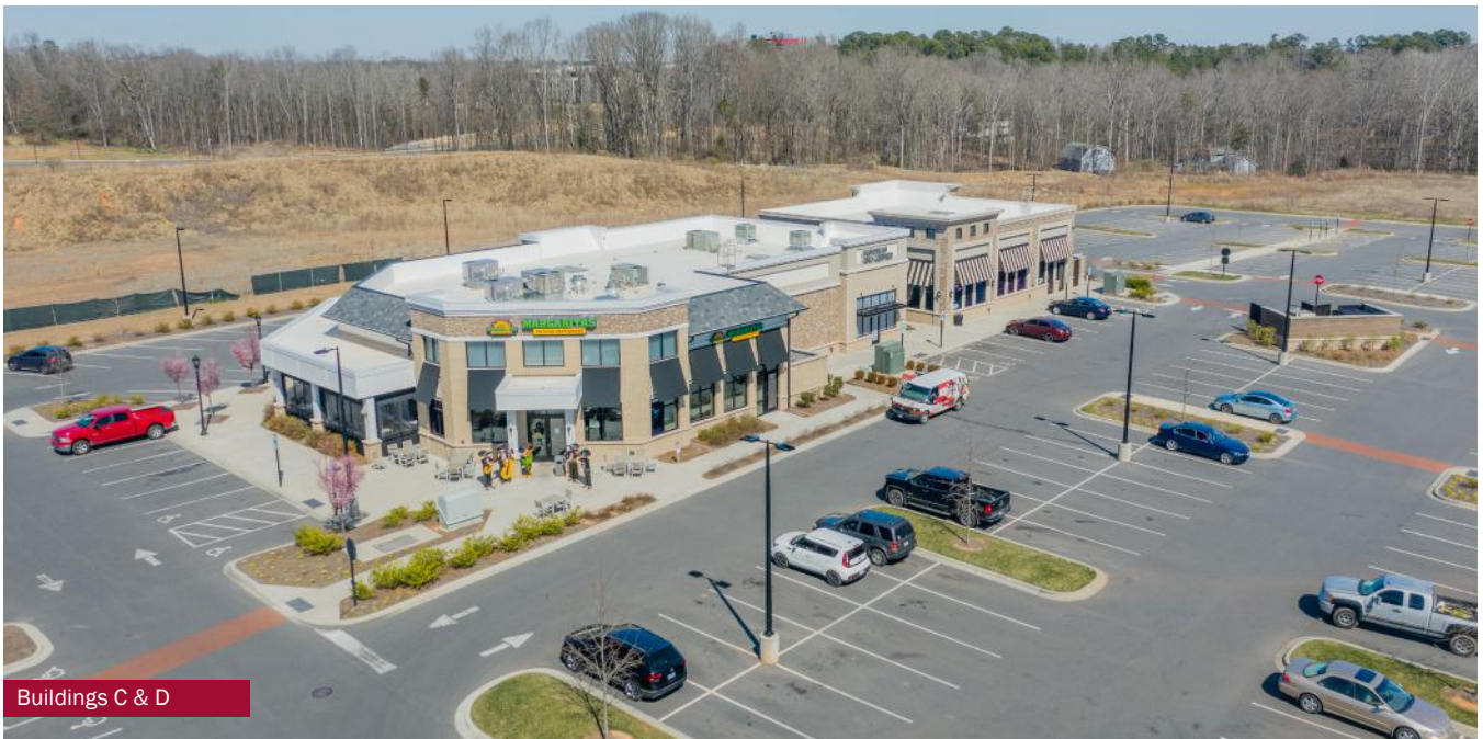
Buildings C & D