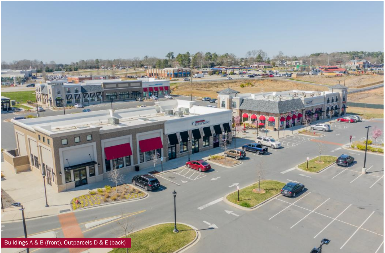
Buildings A & B (front), Outparcels D & E (back)

RedStone 9650 Red Stone Dr, Indian Land, SC