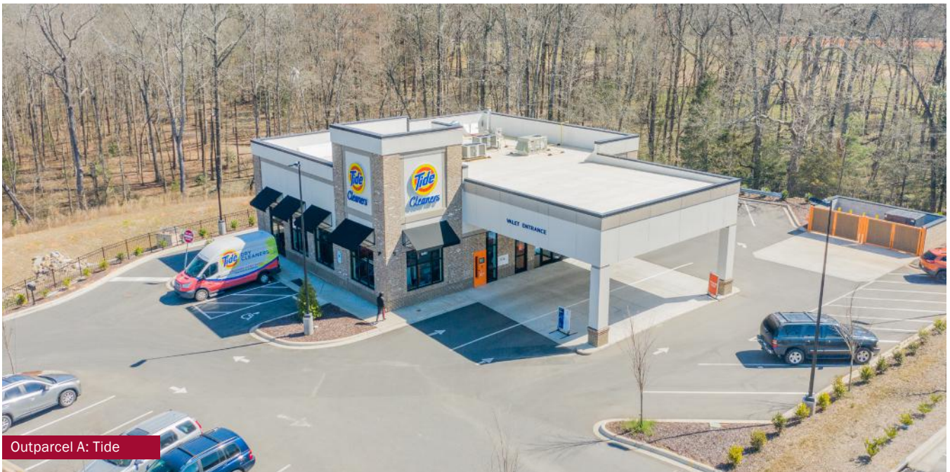
Outparcel A: Tide