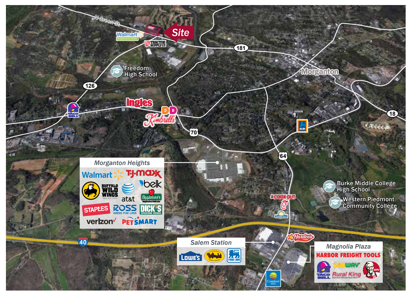
This GIS data is deemed reliable but provided "as is" without warranty of any representation of accuracy, timeliness, reliability or completeness. This map document does not represent a legal survey of the land and is for graphical purposes only. Use of this data for any purpose should be of acknowledgment of the limitations of the data, including the fact that the data is dynamic and is in a constant state of maintenance, correction, and update.