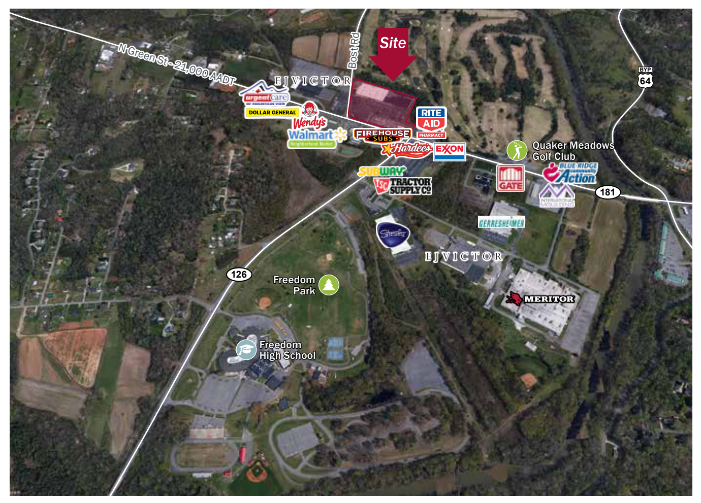
This GIS data is deemed reliable but provided "as is" without warranty of any representation of accuracy, timeliness, reliability or completeness. This map document does not represent a legal survey of the land and is for graphical purposes only. Use of this data for any purpose should be of acknowledgment of the limitations of the data, including the fact that the data is dynamic and is in a constant state of maintenance, correction, and update.